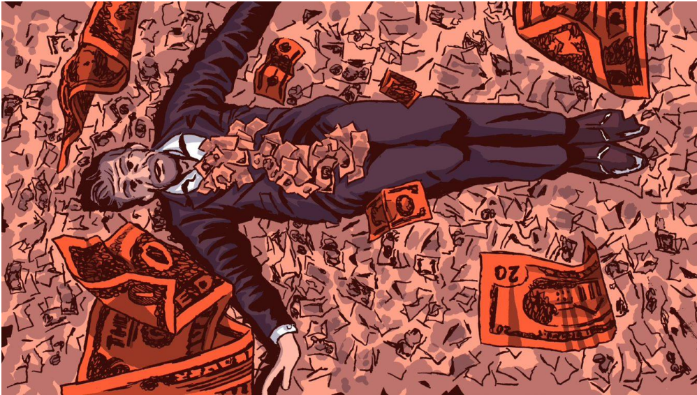
Illustration: Andrea Settimo © Transparency International

More than a year into the crisis, with vaccines already available in many parts of the world, there's a looming question of whether corruption will continue to undermine vaccine distribution too.